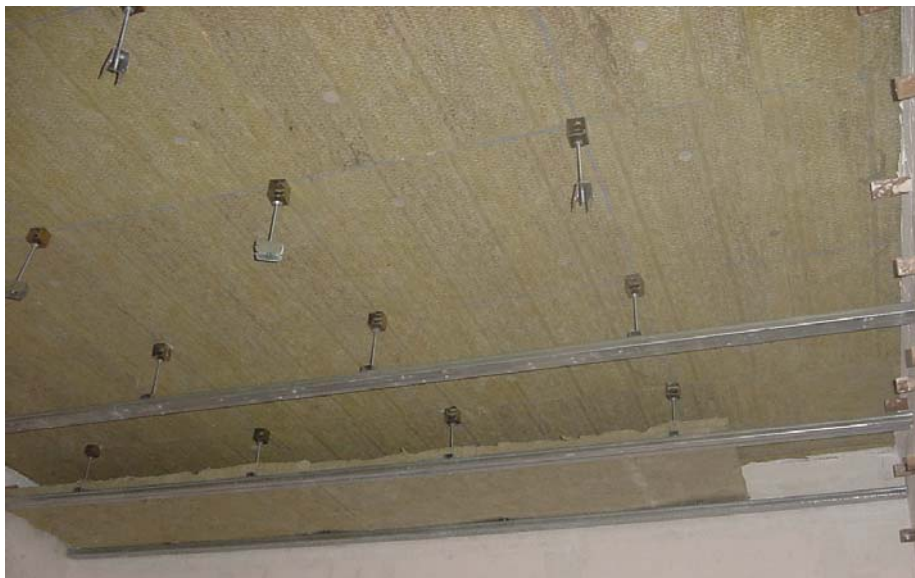
Photo 3: Mounting of the ceiling supports and the second layer of rock wool