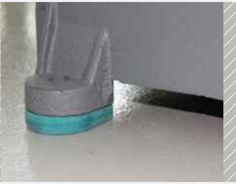
Bearing of machine mountings