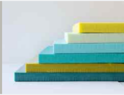
SyloDamp® standard range

SyloDamp®: the ideal elastic material for high material damping