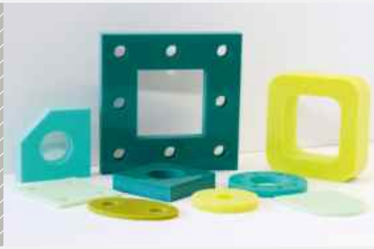
Moulded parts can be produced in a wide variety of shapes and dimensions