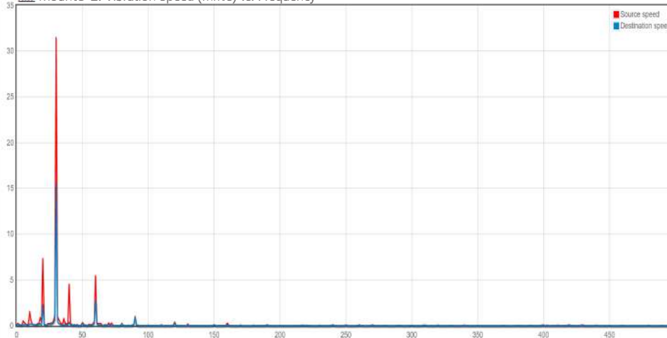
Mount3 Z: Vibration Speed (mm/s) vs. Frequency